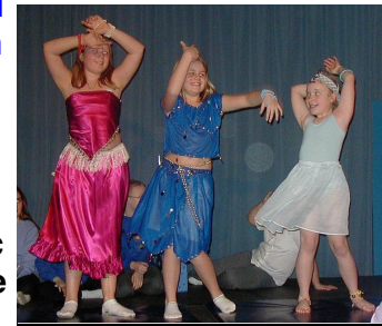
Exotic dancers! St Philip's School, Surrey

power of the strongman who can break rocks with his bare hands. You will be mesmerized by the exotic dancers and frightened by the vicious lions. You will be appalled by the tyranny of Caesar (although the poor emperor is henpecked by the glamourous Cleo.) The children invite you back to 1967 to glimpse the "flower power" people of the swinging